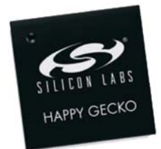
HAPPY GECKO EFM32HG