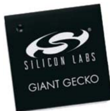
GIANT GECKO EFM32GG