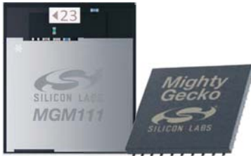
Module MGM111A SoC EFR32MG