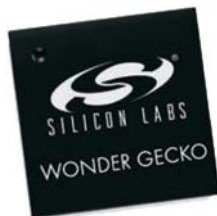
WONDER GECKO EFM32WG